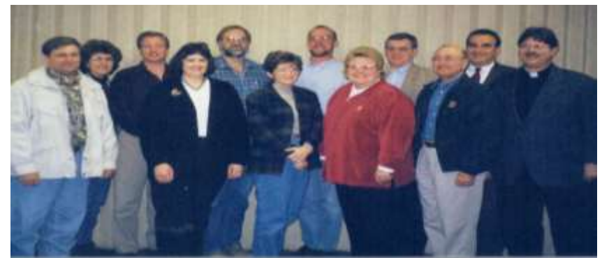
Parish Council 1999

The Parish Council was formed in 1986 under a Diocesan Pastoral Council directive provided by the Diocese of Jefferson City. The functions of the parish council include organizing, promoting, and coordinating apostolic activity within the parish, surveying the spiritual and temporal needs of the individual, family, parish, and community, setting priorities, establishing goals, objectives, and policies to meet those needs, serve as a forum for constructive dialogue among priests, religious, and laity of the parish, and be an advisory body to the parish. The guidelines were in accordance with the Second Vatican Council. All members of the parish share in the parish decision-making processes through a broadly based and representative council. The parish priest and pastoral minister are also members of the council. Four main commissions operate within the council including Worship-Spiritual Development, Social Concerns, Education, and Administration. The council and commissions meet once each month under the leadership of a president with a secretary recording the minutes. Members are nominated and elected by the parish members at large.