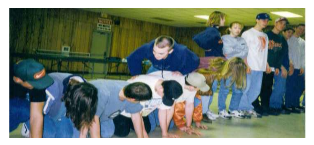
High School Youth Group Enjoys Fellowship