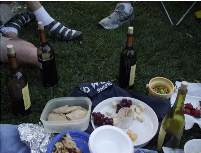
Last year's fun at the wineries.....