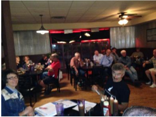
September CSC Meeting