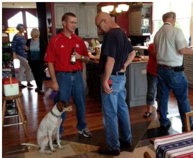
Coco—our official four legged member.