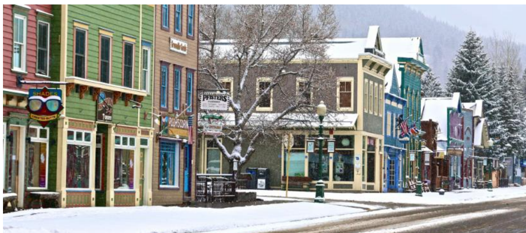
The town of Crested Butte