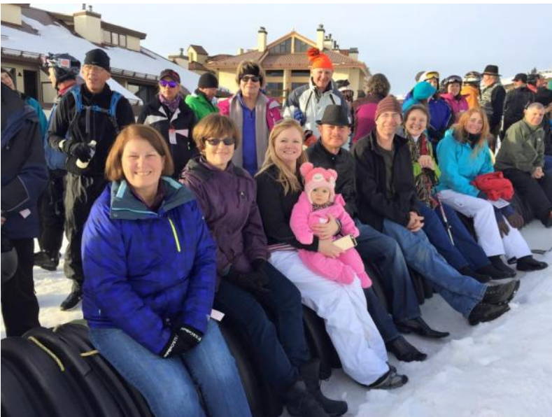
CSCers cheering on the Snowshoe racers.