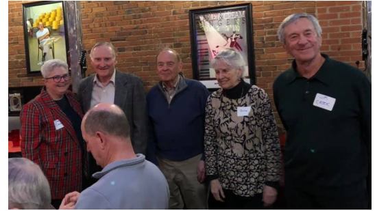
These five were a part of the 45-50 year members.

Now...on to our Club's 51 st ski season!