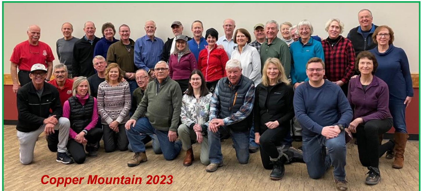
Copper Mountain 2023