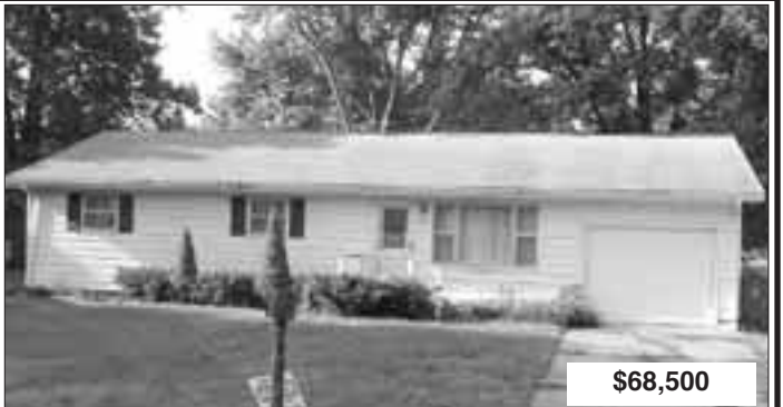
2307 MIMOSA CIRCLE 3 Bedrooms, 2 Bath Great Back yard