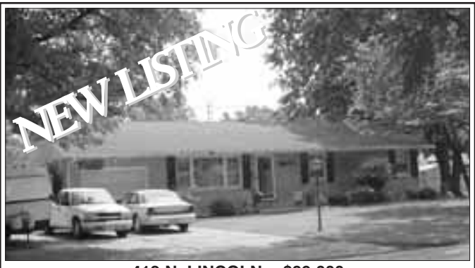
$89,000 412 N. LINCOLN

Are you looking for an affordable home? Look no further. This all Bedford stone home featuring 3 bedrooms, 1.5 baths, an eat in kitchen and a 1 car attached garage. The living room and all bedrooms have hardwood floors. This property also includes a carport and storage shed. Call SKS Realty for your tour!