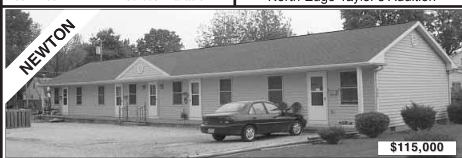
304 LIBERTY AVENUE 4 APARTMENT COMPLEX Quality Built Vinyl Sided

Low Maintenance Refrigerator & Ranges Included