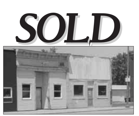
607 & 609 S WHITTLE