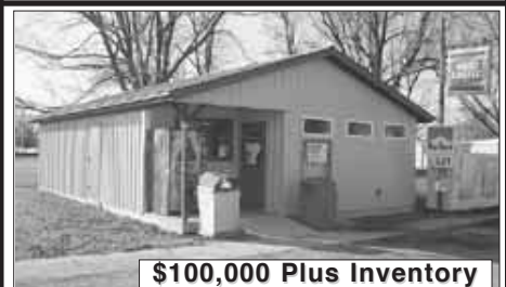
BOTTLE HUT OF NOBLE ON GOING BUSINESS 80' x 100' Lot