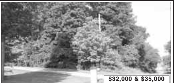
COUNTRY CLUB LOTS Approx. 3.7 ACRES Together 656.23' Frontage on Deer Farm Lane

30' x 50' Quonset Building Call 618-869-2446 For More Info