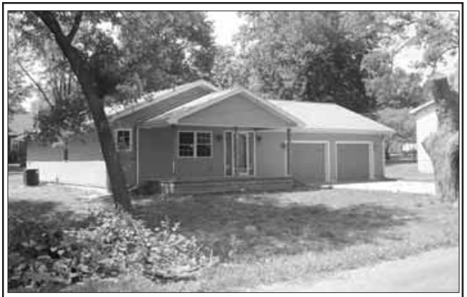
319 W. LOCUST $87,200