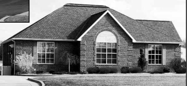
1110 South West Street