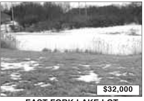
EAST FORK LAKE LOT Water Frontage North Edge Taylor's Addition