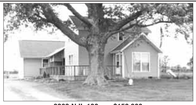
3363 N IL 130 $153.900

Good Ole' Country Living will be yours as the owner of this 3 bedroom, 2 bath Manufactured home situated on a pretty 3 acre plot located south of Olney off Rt 130. 2078 square feet of living space featuring a 21' x 26' family room addition with fireplace and surrounded by a wood deck. Complete with a 30'x40' shed. Call Now!