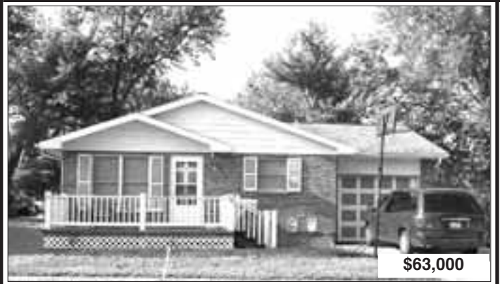
341 WEST CHERRY 3 Bedrooms, 1 Bath