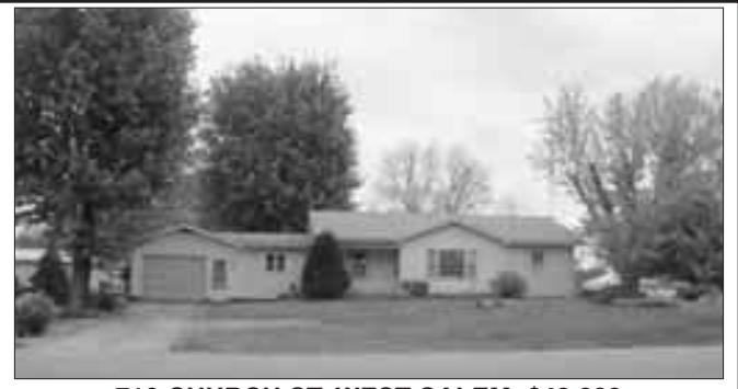
716 CHURCH ST, WEST SALEM $48,000