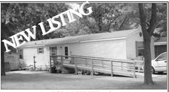
1215 BORAH STREET $35,000

1998 Dutch Mobile Home w/1280 sq ft of living space. Open living room, eat in kitchen, 3 bedrooms, 2 baths with the Master bath offering a garden tub and separate shower. Must be approved by Mobile Home Park. Call today. 395-7577