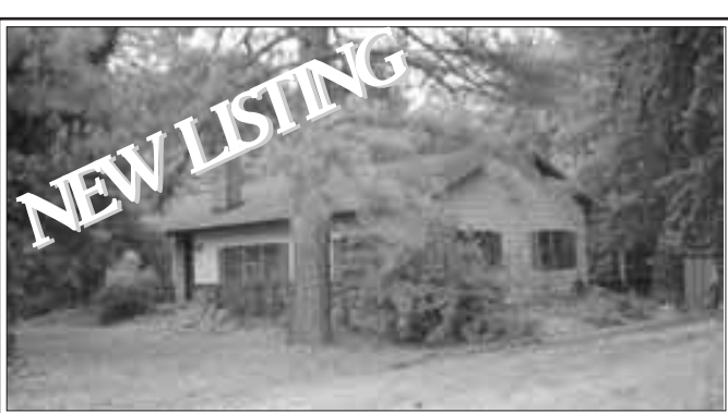
5041 E. ELBOW RD $90,000

Are you looking for an affordable home? Look no further. This all Bedford stone home featuring 3 bedrooms, 1.5 baths, an eat in kitchen and a 1 car attached garage. The living room and all bedrooms have hardwood floors. This property also includes a carport and storage shed. Call SKS Realty for your tour!