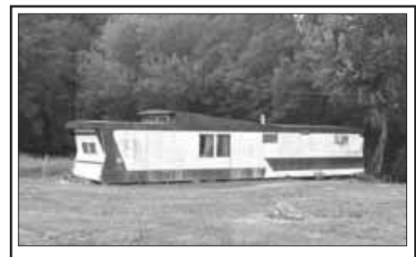
1010 W. CATHERINE ST. $7,000

90'x137' Corner lot in a prime location. Close to schools, hospital, clinic, park.