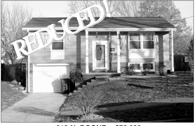
612 N. BOONE $70,000