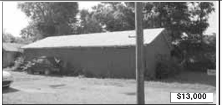
220 NORTH FIRST, NOBLE 160' x 85' Lot 48' X 24' Shop, Concrete Floor and 48' x 13' Lean To 12' x 14' Open Garage City Utilities

16 ACRES - 9 Tillable 70' x 50' Building Good Deep Water Well $95,000