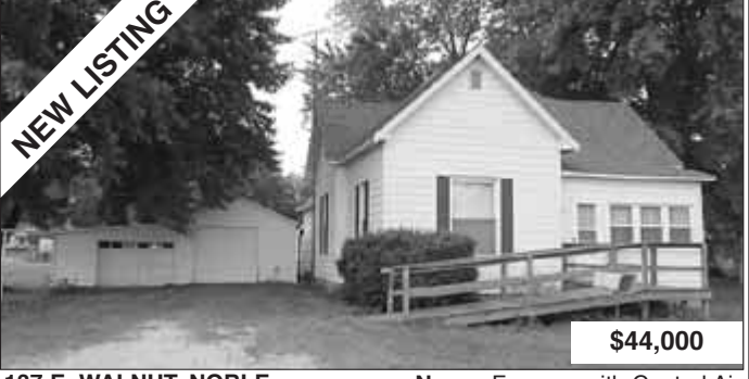
137 E. WALNUT, NOBLE 2 Bedrooms Eat in Kitchen