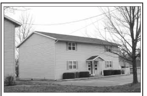
829 S. MORGAN $140,000

Remove the house and you will have a 61'x160' lot to build your dream home. Call SKS Realty for more information. 395-7577