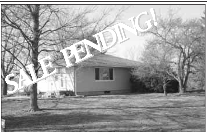
7331 N. IL 130, DUNDAS $86,500