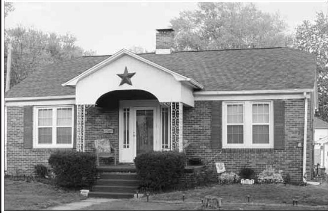
220 S. GRANT $67,000