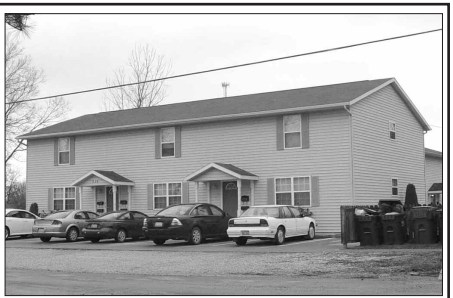
236 E. MONROE $180,000