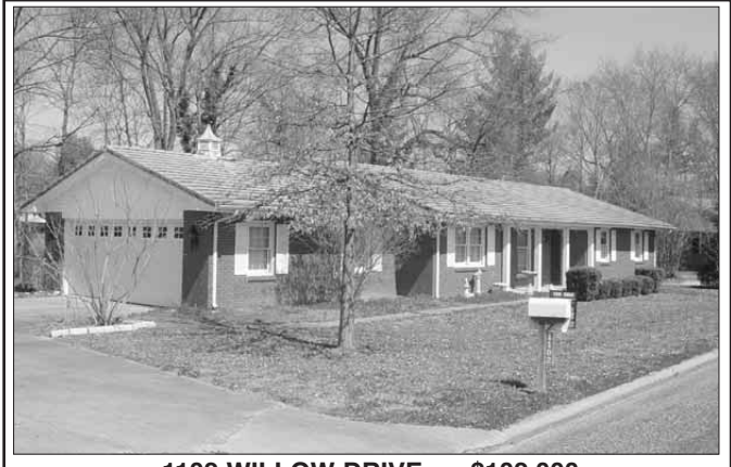
1102 WILLOW DRIVE $102,000