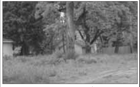
422 S RICHLAND $10,000

Two lots (93 ft wide x 129 ft long.) Located near the end of the street with no through traffic.