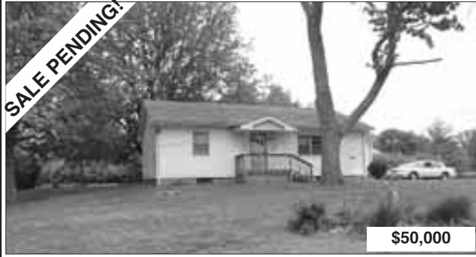
140 E. SOUTH, CLAREMONT 3 Bedrooms, 1 Bath Basement