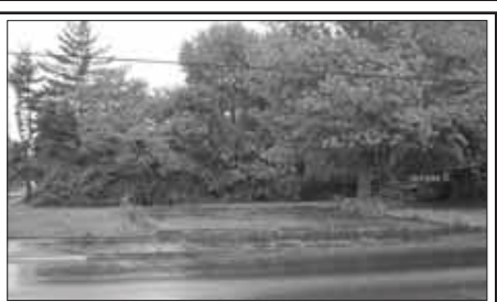
401 N EAST $27,500

Are you ready to build your dream home? Take a look at this beautiful, tree lined corner lot in Doenges Estates. This Lot is 140' x 120' and is located on the corner of Shurron and Heather. Call SKS at 395-7577