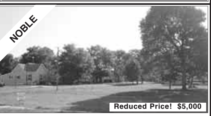
Corner of N. FIRST & W POPLAR 85'x 160' UTILITIES AVAILABLE