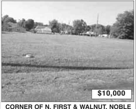
CORNER OF N. FIRST & WALNUT, NOBLE 160' x 200' Utilities Available