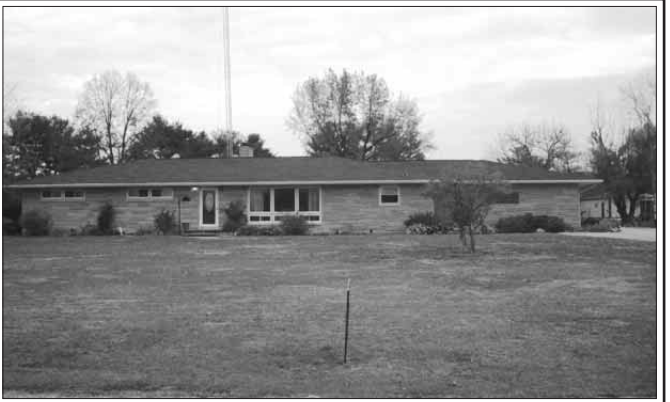
4442 N. HOLLY $174,900