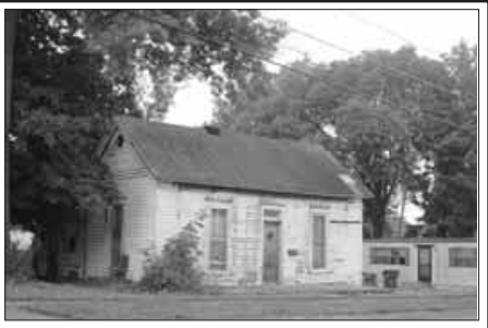
321 E LAFAYETTE $15,000

Remove the house and you will have a 61'x160' lot to build your dream home. Call SKS Realty for more information. 395-7577